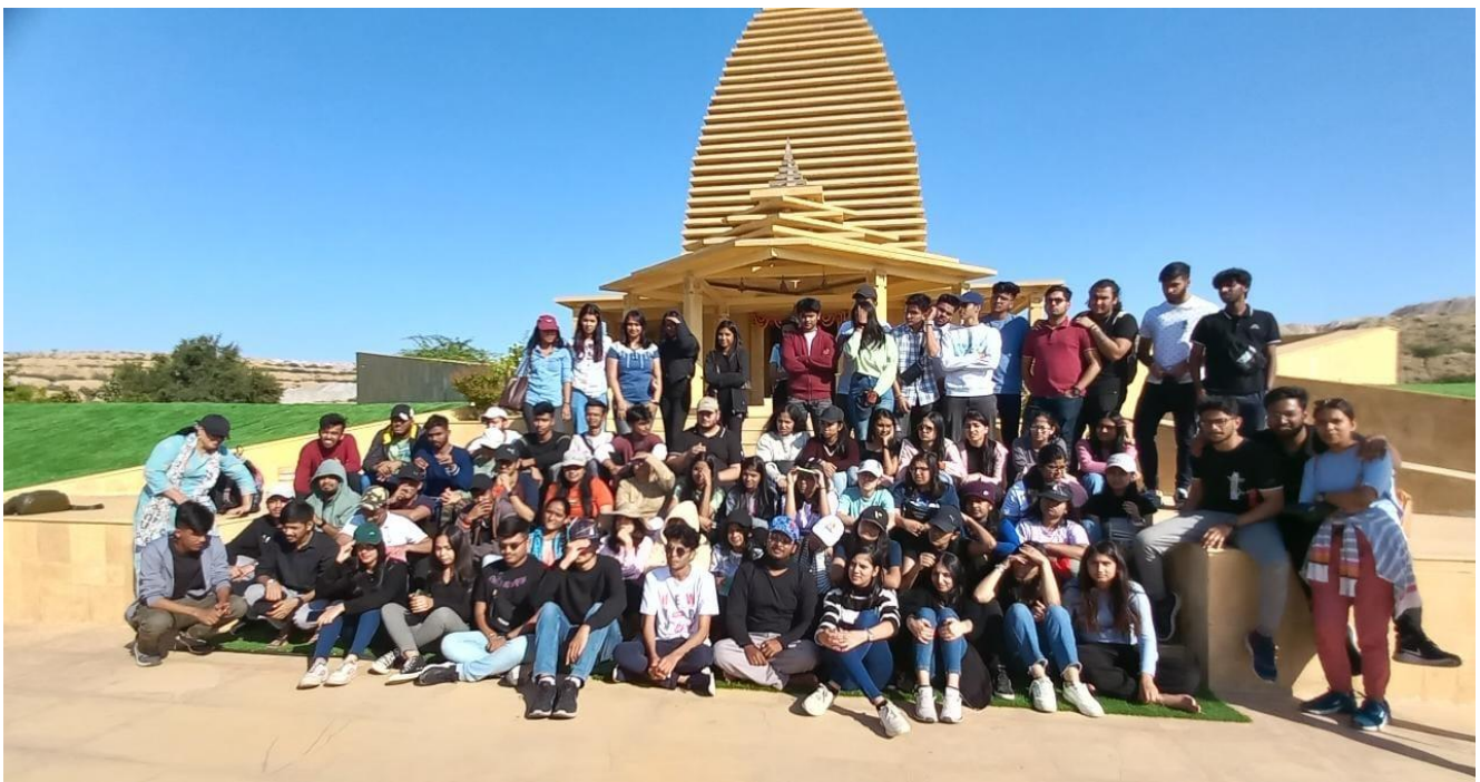
Figure 5 Temple in Stone & Light by SpaceMatters

Along with the Birkha Bawri, the students also visited a contemporary temple where a Hindu & Jain temple shared the same stone plinth and was part of the Umaid Heritage complex. Above the complex, was situated the popular Umaid Bhavan Palace , where students explored the museum & the gallery of vintage cars. One of the evenings was spent doing experiential mapping at Mandore Gardens where landscape and architecture blended into creating a sensuous experience.