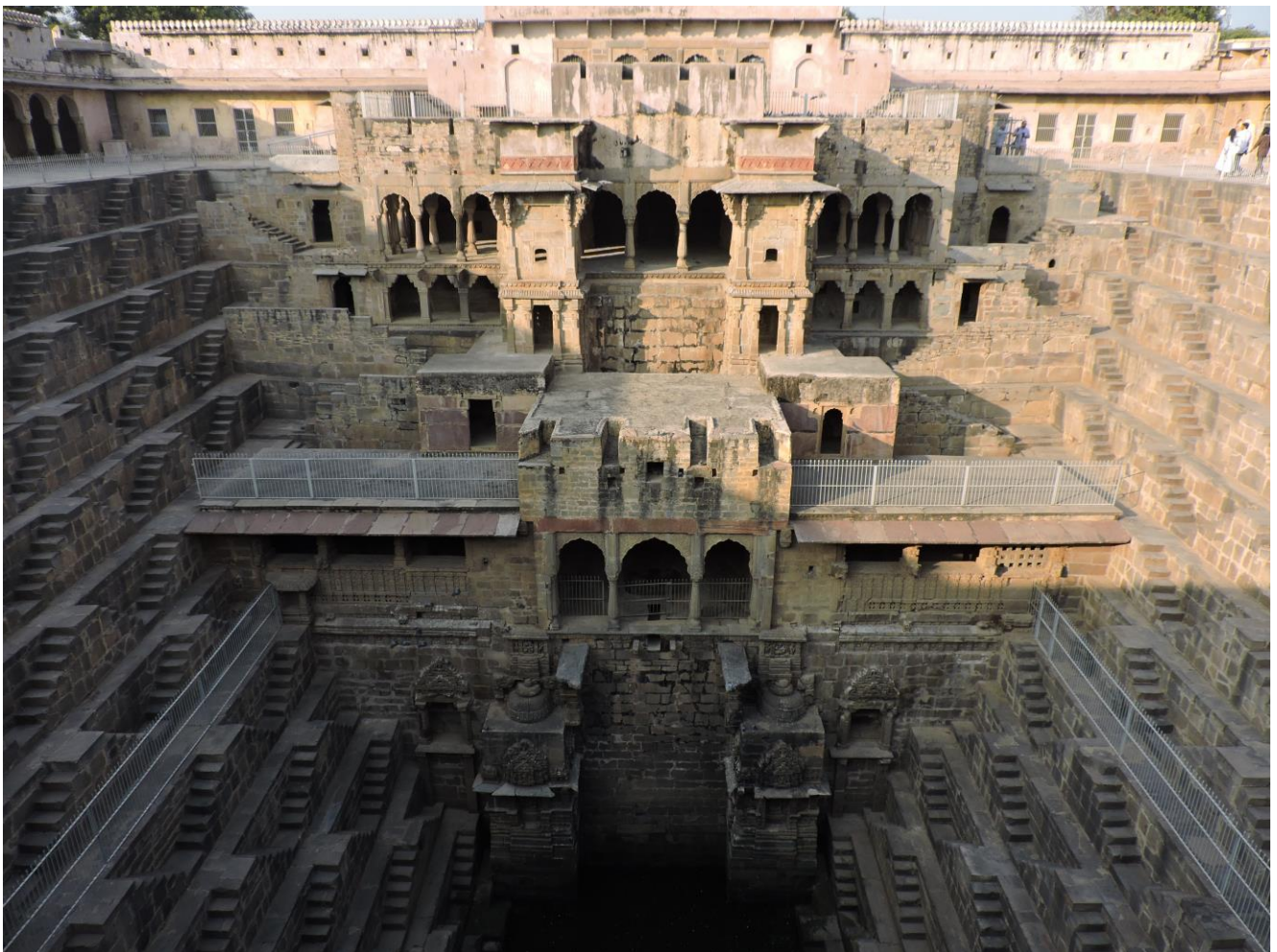
Figure 8 Chand Bawari