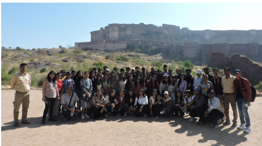
Figure 2 Rao Jodha Desert Park