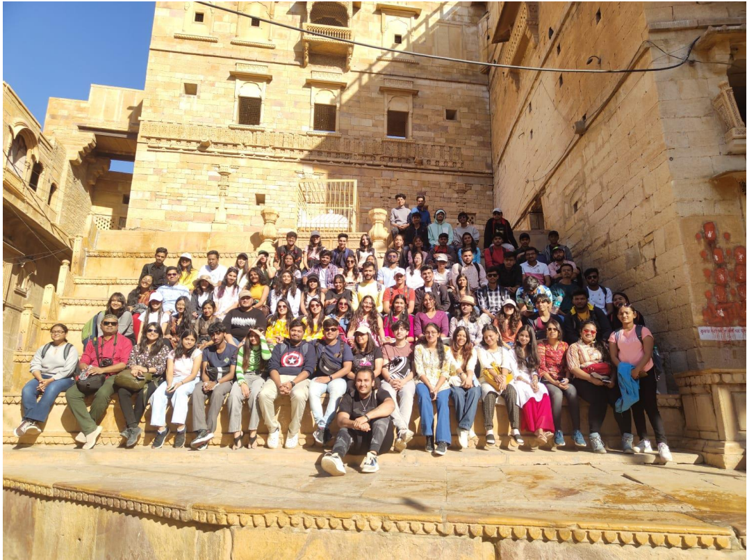
Figure 6 Sonar Fort, Jaisalmer