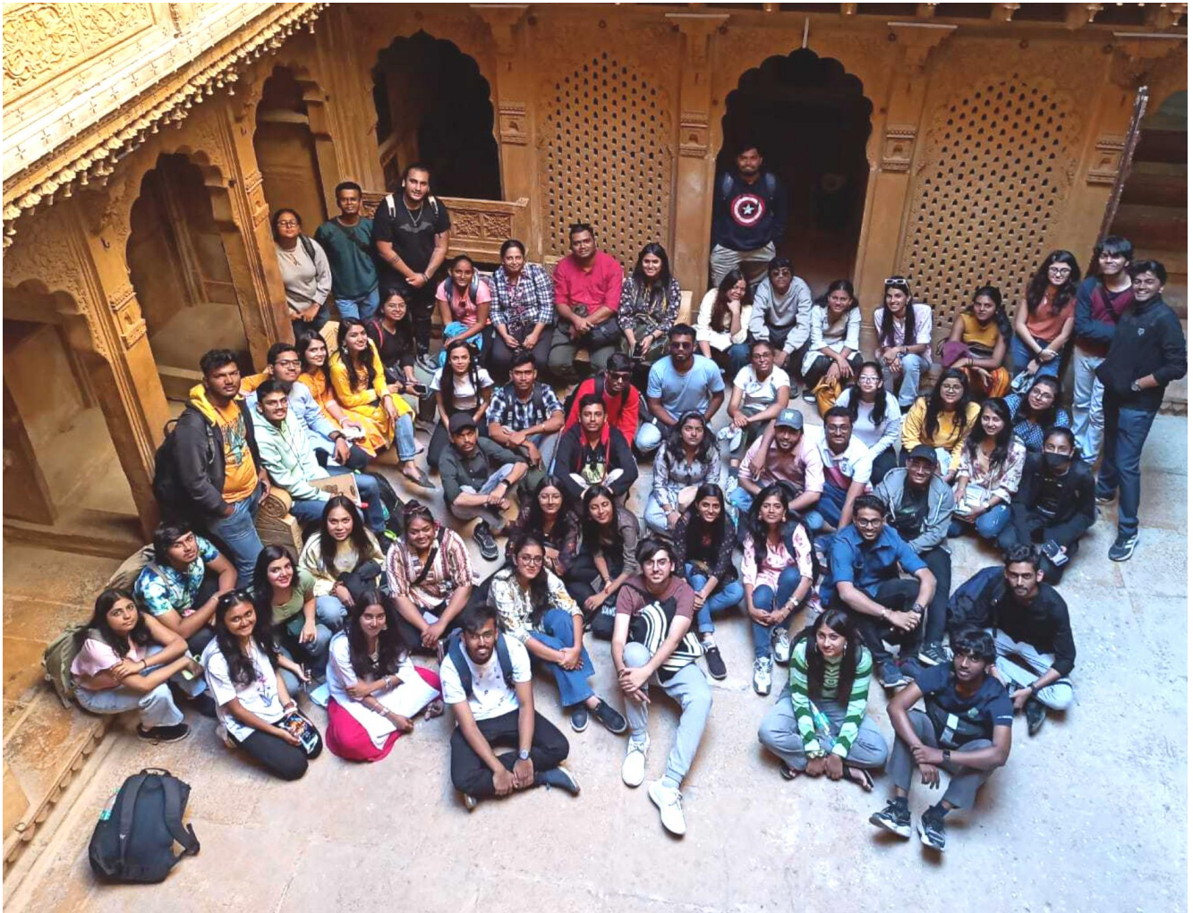
T.Y. B'Arch Educational Tour 2022 Jodhpur | Jaisalmer | Jaipur