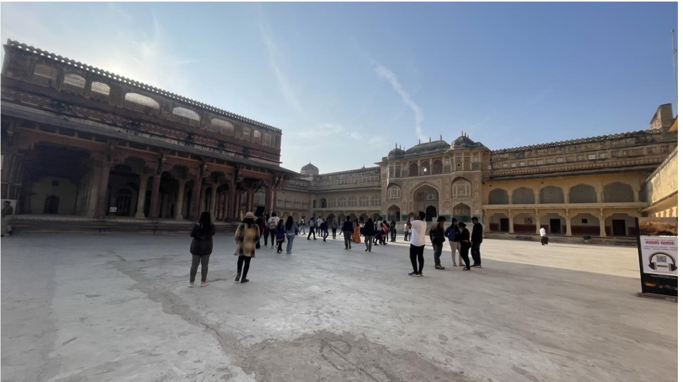
Figure 10 Amber Fort