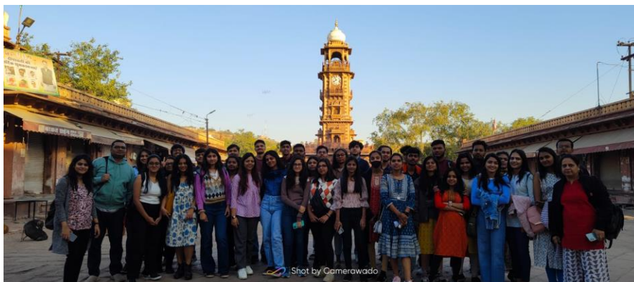
Figure 1 Heritage Walk, Jodhpur

The Tour began in the city of Jodhpur where the students walked through the heritage streets towards the Mehrangarh Fort and explored the planning of the fortress, the vernacular elements and intricate details of the façade and interiors within. Below the fort is an architecture & ecological restored site, The Rao Jodha Desert Park which was established to remove invasive alien plants and bring back the original desert and arid land vegetation of the region. An educational tour was conducted within the park under the guidance of trained guides and naturalists.