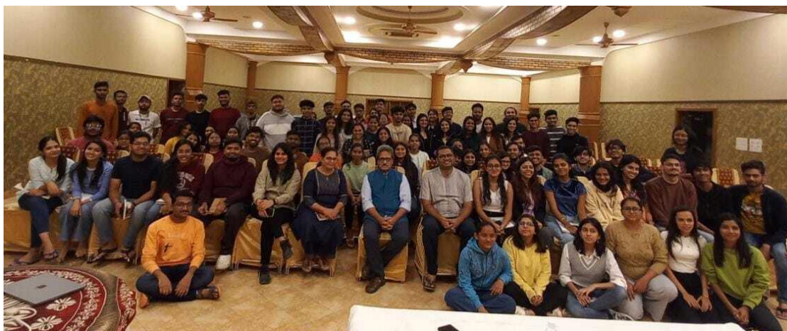
Figure 3 Insights Lecture by Ar. Anu Mridul

As a part of L.S.Raheja School of Architecture's Insights Lecture Series, a presentation by a well known Architect, Anu Mridul , was organized after a physical visit to Birkha Bawari , a modern water harvesting system inspired by India's ancient Kunds & Bawaris, located within the Umaid Heritage Housing complex. The Architect addressed the issue of water shortage happening in various parts of India and how they can be resolved using various systems of harvesting and management. It was truly an inspirational lecture.