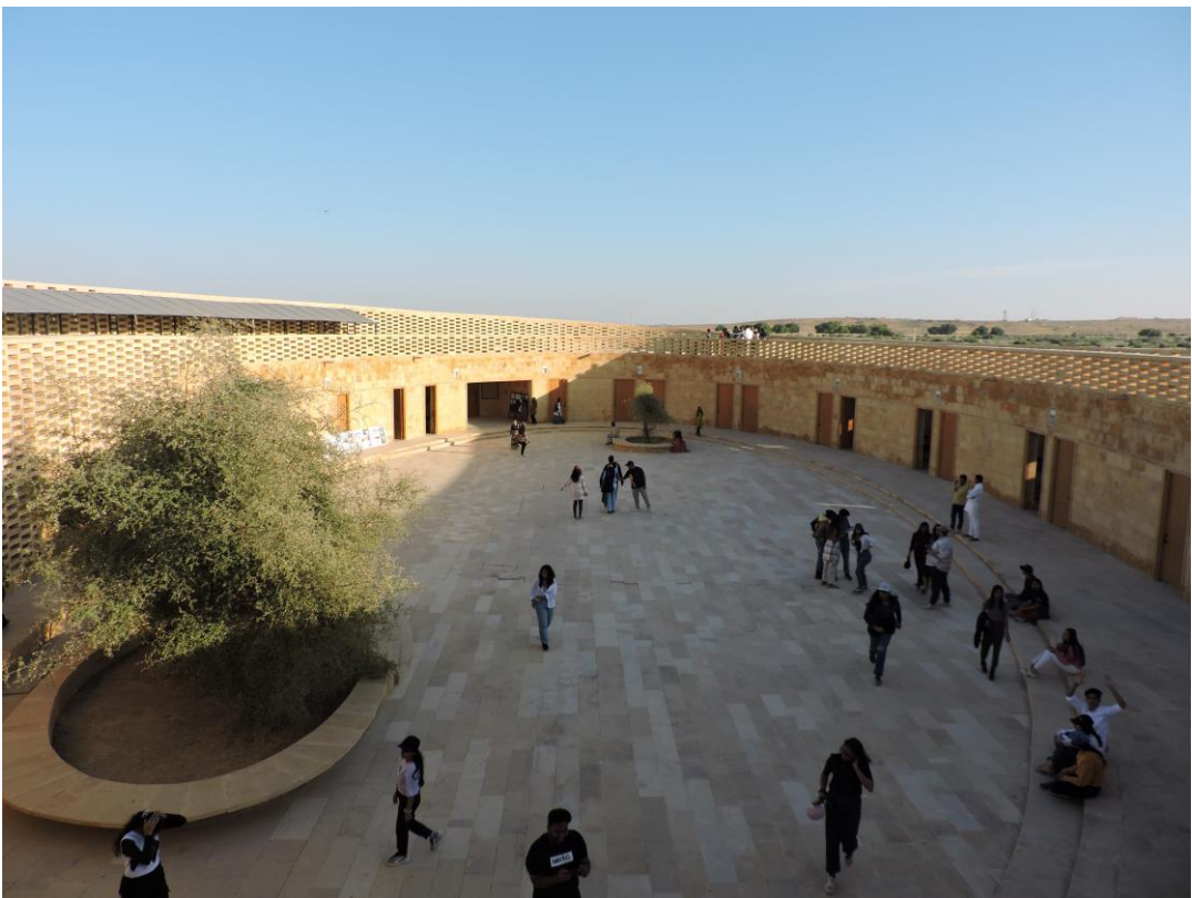
Figure 7 Rajkumari Ratnavati Girl's School