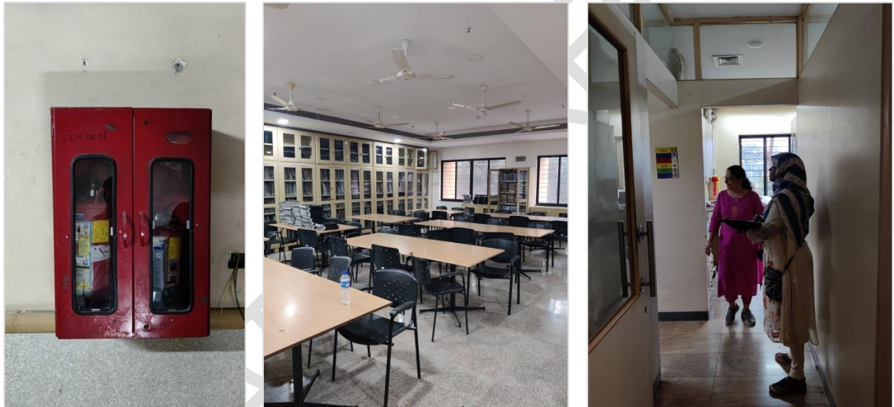
Plate 2: Investigation of the fire & lie safety practices and internal spaces of campus