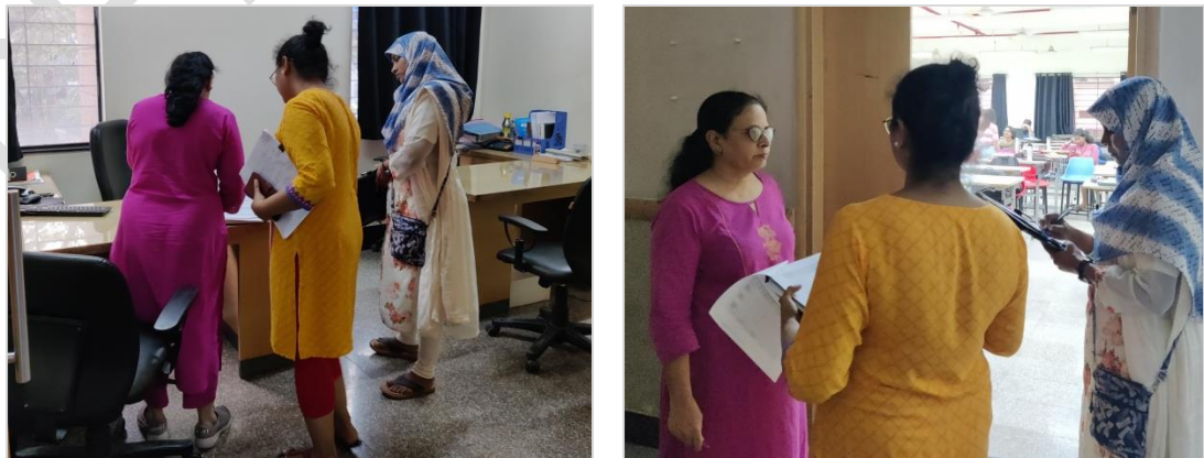
Plate 3: Discussion with the internal team about the facilities