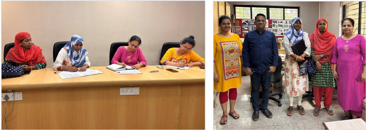
Plate 1: Discussion with the team and Principal of the Institute