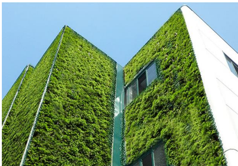
Plate 5: Green roof (For reference purpose only)