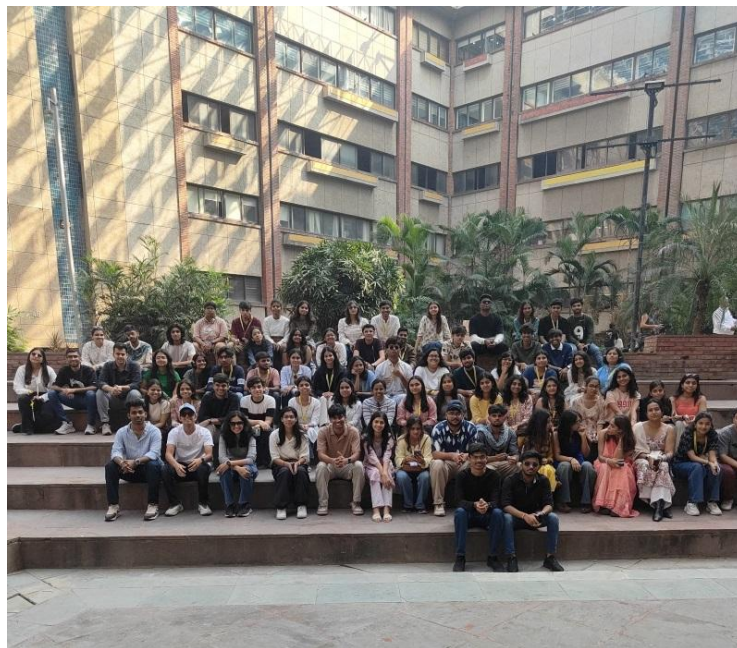
Fig. 12: At the Indian Habitat Center