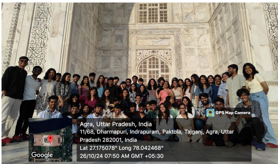
Fig. 17: At the Taj Mahal, Agra

On the next day of arrival at Agra, the class visited the Taj Mahal , a UNESCO World Heritage site and an iconic symbol of love and Mughal architecture. Post Taj Mahal, the class visited Fatehpur Sikri , a historic city built by Emperor Akbar in the 16 th century, serving as the Mughal capital for a brief period. It is renowned for its impressive architecture, including the grand Jama Masjid and the beautiful Buland Darwaza . The official tour concluded at Agra. The class travelled to Mathura Station to begin their return journey to Mumbai.