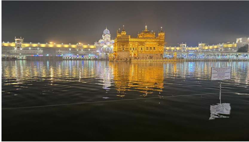
Fig. 8: Golden Temple, Amritsar

In the morning, students visited the Jallianwala Bagh Memorial , which is designed to offer a walkthrough of the historic event and the activities surrounding it, both before and after the massacre. The story is told through a series of galleries, videographics, and exhibits. The preserved bullet marks on the walls and the well, where many victims tragically lost their lives while trying to escape, directly narrate the events of that fateful day.