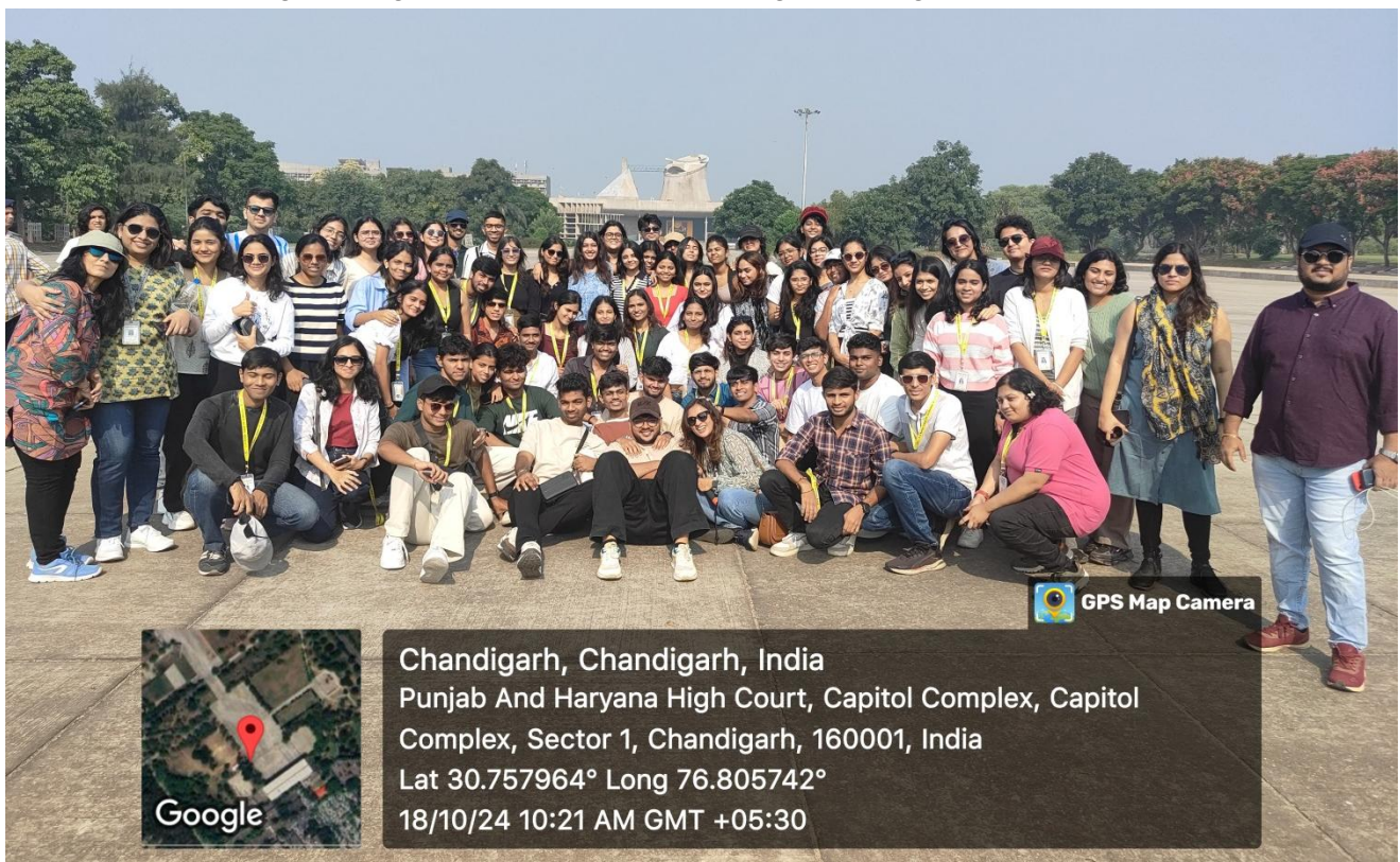
Fig. 3 : Visit to the Capitol Complex