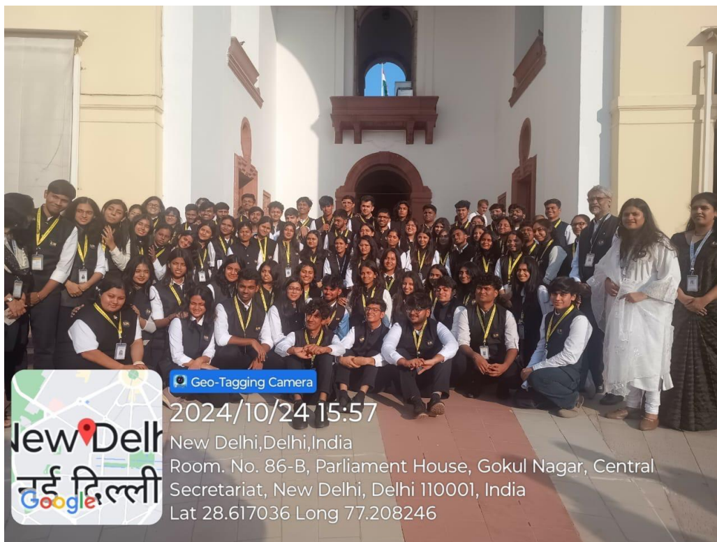
Fig. 15: Visit to the Parliament House