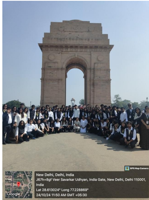
Fig. 14: At India Gate

The institute, through special permission had planned a visit to Parliament House on the 24 th October, 2024. The day began with a visit to India Gate & War memorial in the morning. The Parliament Visit started with an introduction to the new opportunities at the Parliament. The guided tour showcased the students the old and new parliament houses, along with all important nodes and galleries within the structure.