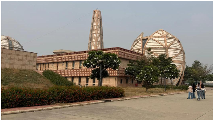
Fig. 9: Jung E Azad