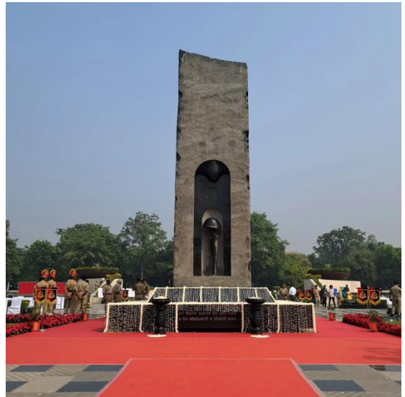
Fig. 10 & 11: Introductory Lecture at the Police Memorial