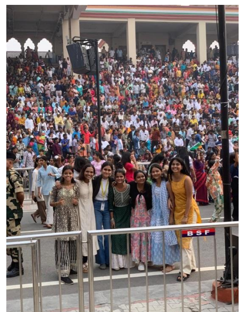
Fig. 7: Visit to the Atari Wagha Border