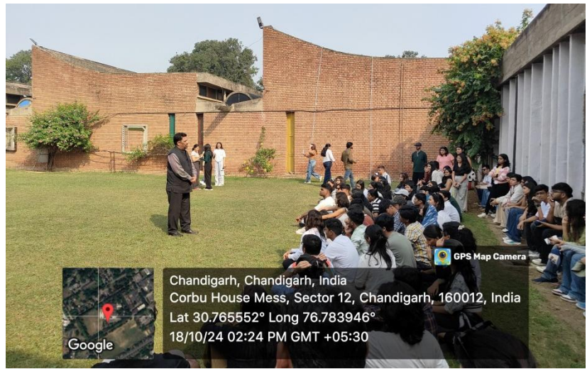
Fig. 1 & Fig. 2 : Rock Garden & Chandigarh College of Architecture