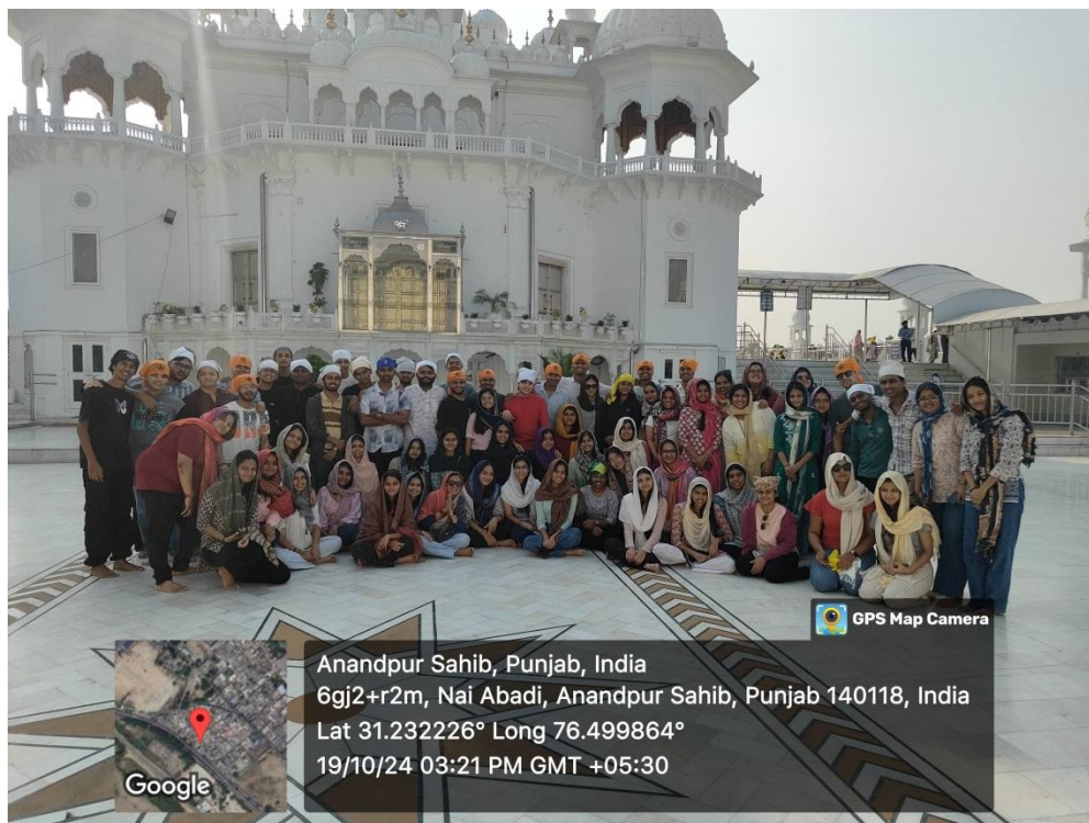
Fig. 5 : Anandpur Sahib Gurudwara