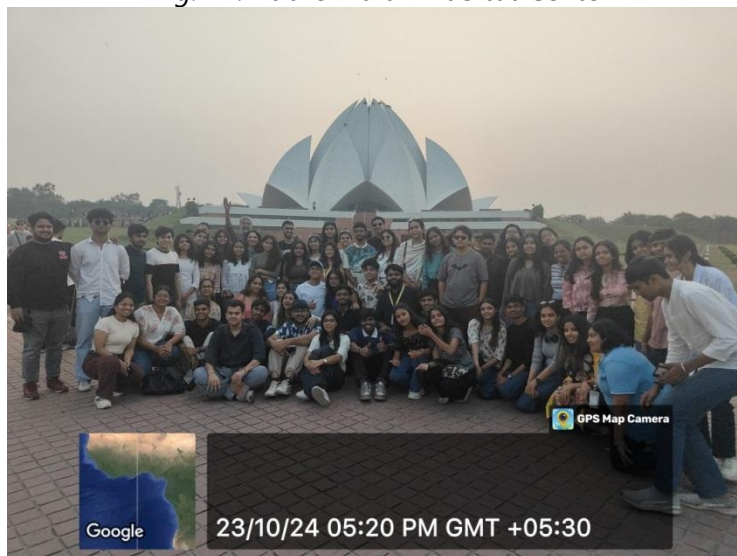
Fig. 13: Lotus Temple