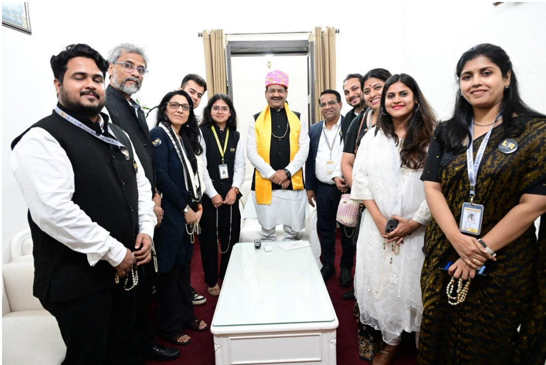
Fig. 16: Visit to Mr. Om Birla's Residence

The evening concluded with the Principal and Faculty, meeting with Mr. Om Birla, the Speaker of Lok Sabha at his residence, and the class strolling through the Connaught Place .